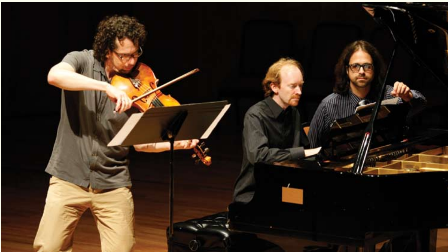
Composer Culmination, 2008

Coordinator, Composer-Performer Collaboration: an Interactive Workshop for Composers , 2008