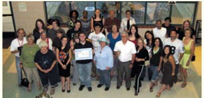
Summer Arts Alumni, 2008

Please join us on July 10th for our 3rd Annual Alumni Celebration! There will be a special alumni dinner in the University Restaurant for those who RSVP by June 29th. Student Culminations begin at 10:00am and run until 10:00pm, and we hope to see you out supporting all of our first-session courses in their culminating events throughout the day. E-invitations will be sent out in early June for the dinner.