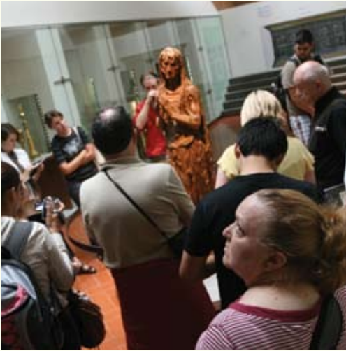
Drawing and Painting in Florence Class, 2008

Student, Drawing and Painting in Florence , 2008