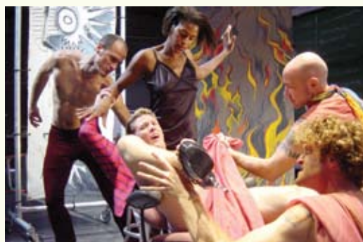
Oregon Shakespeare Festival