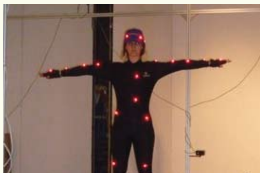
Animation class, 2008