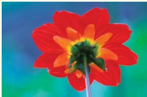
Back Red Dahlia